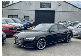
2017 Audi A4 S Line Auto

Finance available with zero deposit Trade in welcome 121k Miles Diesel